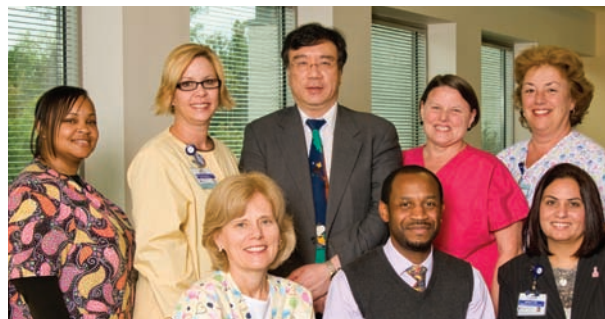
Specially trained members at Inova Loudoun Hospital Radiation Oncology Center.