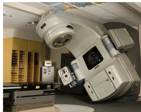
Linear accelerator with intensity-modulated and image-guided capability