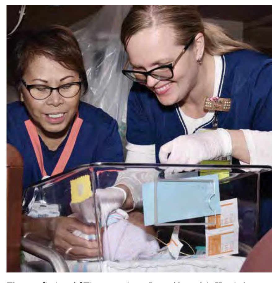
The 2019 Spring2ACTion campaign at Inova Alexandria Hospital provided items for the Neonatal Intensive Care Unit.

Through generous donations from the Alexandria community, the campaign raised $30,060 to support IAH's smallest patients. These funds were able to secure the NICU with new equipment to include: TurtleTubs, mamaRoo® swings and new rocking chairs and footrests. ©