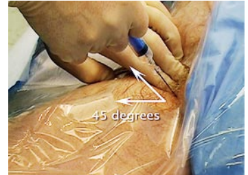
Figure 1. Inserting the Introducer Needle.

Several studies have shown that using ultrasonography to assist in central-catheter placement increases success and reduces complications. 2,3 Choose a linear probe rather than a curved probe for femoral catheter placement. Linear probes emit high-frequency waves that are optimal for viewing superficial structures, such as the femoral vessels. Position yourself toward the patient's feet, and place the ultrasound monitor in front of you. Orient the probe so that the patient's right is on the right side of the screen. Place the probe in a sterile sheath with coupling gel inside. Sterile gel can be applied to the outside of the protective covering. Placing the patient in a reverse Trendelenberg position engorges the femoral vein and may aid in visualization. Ultrasound imaging renders vessel walls brighter than their lumens, which are filled with blood. The femoral vein is collapsible as compared with the artery. Use of the Doppler function of the ultrasound machine may help distinguish pulsatile (arterial) from more continuous (venous) blood flow. Position the vein in the center of the screen, and insert the needle at the center of the probe (Fig. 4). After the ultrasound images indicate that the needle is in an appropriate position for entering the vein, you will also note the intravenous location by observing a flash of blood into the syringe.