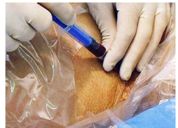
Figure 2. Anchoring the Needle.