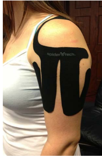
Figure 2 — Final application of the SpiderTech Shoulder Spider used on the experimental-group participants.

The participants randomly allocated to the control group sat quietly without movement for 5 minutes to account for the time needed for the participants in the experimental group to have the kinesiology tape applied. This step ensured that both control and experimental groups had an equivalent amount of time between testing periods. After the intervention, all participants immediately repeated the procedures for joint-reposition-sense testing while wearing the blindfold. The target angles calculated for the preintervention joint-reposition-sense testing were used in postintervention testing. Joint-reposition-sense error scores from the 3 repositioning trials of each position were calculated as the difference in degrees between the angle recorded during the active