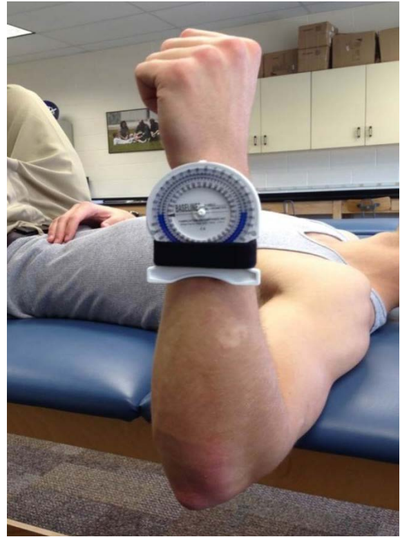
Figure 1 — Use of the bubble goniometer when measuring external- and internal-rotation ranges of motion with the participant in the supine position.

The joint-reposition-sense testing first required a calculation of the target angle based on the active-ROM measurement. The target angle was calculated by subtracting 10% of the total ROM (external rotation + internal rotation or flexion + extension) from the maximum active ROM being tested. For example, if the